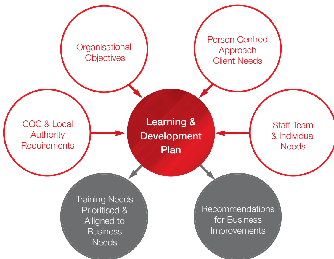
Figure 1.1 Factors surrounding a Learning and Development Plan.

working environment, have a greater sense of job satisfaction and therefore staff retention levels will improve. Dedicated and attentive staff will create a greater audit trail and drive innovative ideas throughout the business. A combination of these factors will have a direct result on users of your service, customer satisfaction will improve and this will directly affect the marketability of the entire organisation. When your workforce is efficient, you will be able to achieve an excellent return on investment and this will also allow you time to review your organisational objectives.